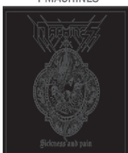
SICKNESS AND PAIN